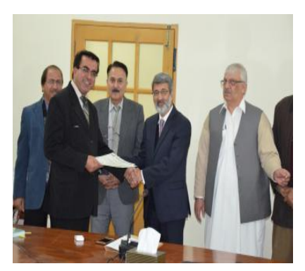
Progress of QEC: